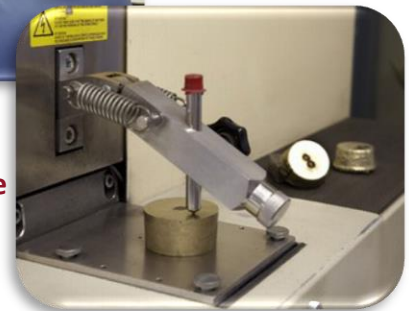
Chemistry checked on every ladle via in-house Spectrograph